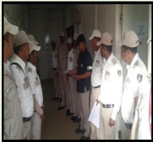
QZS – BCC Site