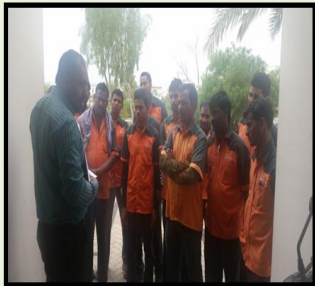
QZS – Hidd Lulu Site