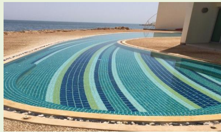
Well done to Dream Pools Team!

Dream Pools continues to provide wide range of beautifully designed swimming pools.